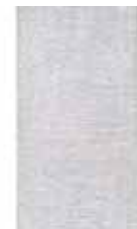
918 Organdy 631 Silver