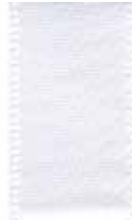
088 DF Satin 029 White