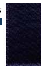
088 DF Satin 374 Peacoat