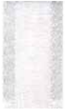
938 Delight 601 White