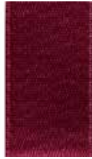
035 Swiss Satin 78 Wine

Comparable to: Watermelon, Mahogany & Burgundy