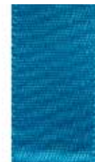
088 DF Satin 326 Methyl Blue