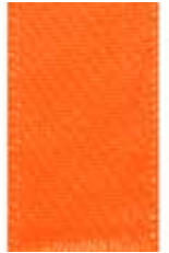
087 Neon & Brights 629 Neon Tangerine