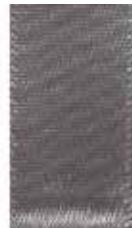
088 DF Satin 017 Metal Grey