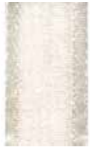
938 Delight 600 Bridal White