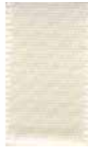
088 DF Satin 028 Antique White