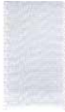
035 Swiss Satin 401 White

Comparable to: "Perfect Palette" White, White Satin & White Wedding