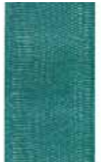
918 Organdy 044 Jade