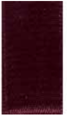
088 DF Satin 277 Burgundy