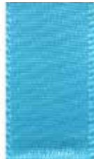
088 DF Satin 317 Misty Turquoise