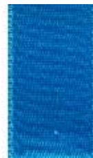
035 Swiss Satin 303 Turquoise

Aqua Marine, Malibu, Turquoise & Blue Box