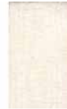
918 Organdy 004 Ivory