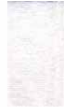
918 Organdy 601 White