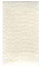
035 Swiss Satin 23 Ivory

Comparable to: Ivory, Antique White & Talc White