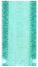
938 Delight 319 Tiffany Blue