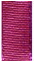
464 Lyon 169 Magenta