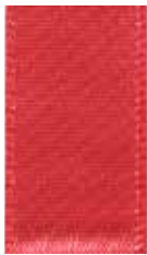
088 DF Satin 243 Watermelon