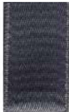
035 Swiss Satin 43 Elephant

Comparable to: Platinum, Silver & Charcoal