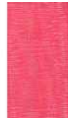
918 Organdy 409 Hot Coral