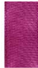
96 Dream 616 Magenta Frost