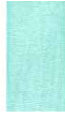
918 Organdy 319 Tiffany Blue