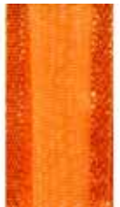
938 Delight 620 Orange