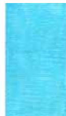
918 Organdy 712 Turquoise