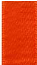
088 DF Satin 751 Russet Orange

Comparable to: Orange, Tangerine & Persimmon