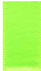
088 DF Satin 544 Key Lime