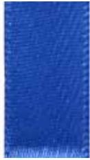
088 DF Satin 350 Royal

Comparable to: Blue, Cornflower & Marine Blue