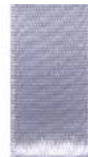
035 Swiss Satin 30 Silver