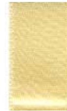
035 Swiss Satin 007 Buttercream

Comparable to: Pale Sun, Canary & Sunshine