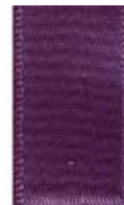
088 DF Satin 473 Amethyst