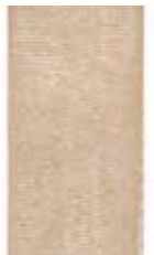
918 Organdy 546 Sable