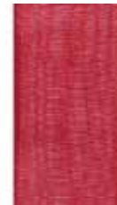
918 Organdy 194 Rose Red