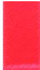
087 Neon & Brights 609 Neon Red