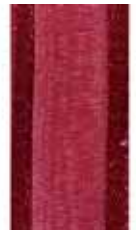
938 Delight 194 Rose Red