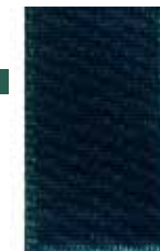
088 DF Satin 347 Teal