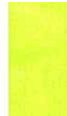
918 Organdy 502 Citrus