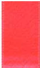
035 Swiss Satin 998 Neon Red