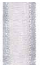
938 Delight 631 Silver