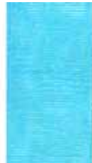
918 Organdy 712 Turquoise