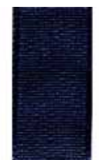
96 Dream 624 Navy