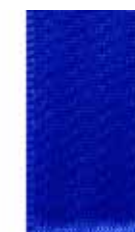
088 DF Satin 352 Electric Blue