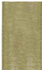
918 Organdy 892 Willow