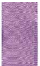
96 Dream 026 Lavender Frost