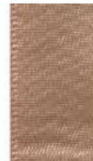
088 DF Satin 837 Latte

Comparable to: Honey & Wheat, Golden & Maize