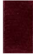
035 Swiss Satin 357 Dark Ruby