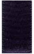
088 DF Satin 330 Dresden Blue