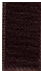
035 Swiss Satin 46 Chocolate

Comparable to: Choco, Licorice & Espresso