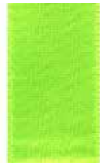
035 Swiss Satin 996 Neon Green