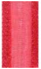
938 Delight 409 Hot Coral