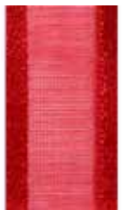
938 Delight 609 Red