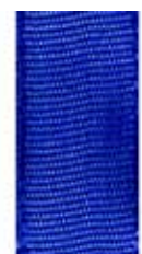
464 Lyon 614 Blue