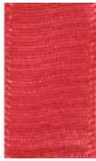
088 DF Satin 243 Watermelon