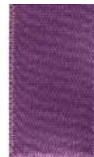
035 Swiss Satin 262 Amethyst