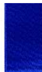
035 Swiss Satin 40 Royal