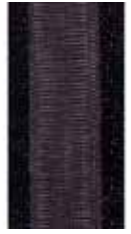
938 Delight 613 Black