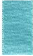
035 Swiss Satin 319 Tiffany Blue