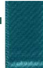
088 DF Satin 346 Jade