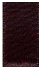
088 DF Satin 860 Licorice