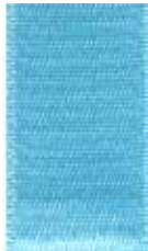
035 Swiss Satin 70 Aqua