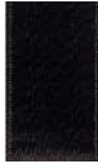
035 Swiss Satin 725 Black