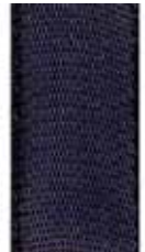
464 Lyon 310 Royal Purple