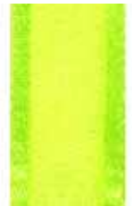
938 Delight 502 Citrus