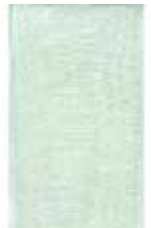
918 Organdy 36 Soft Mint