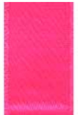
035 Swiss Satin 999 Neon Pink