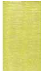
918 Organdy 037 Kiwi