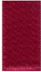
088 DF Satin 193 Beauty