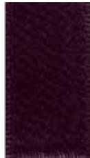
088 DF Satin 290 Shadow Purple