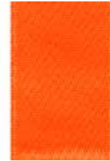
035 Swiss Satin 997 Neon Orange

Comparable to: Neon Tangerine & Hunter Orange