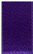
035 Swiss Satin 52 Royal Purple