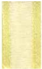
918 Organdy 615 Light Yellow