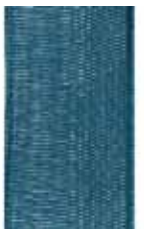
918 Organdy 603 Teal