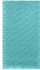
088 DF Satin 319 Tiffany Blue