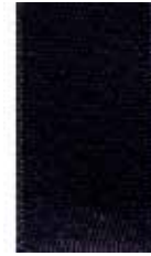
035 Swiss Satin 21 Midnight Blue