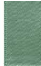
088 DF Satin 577 Sage Green

Comparable to: Sage, Meadow, Mint & Clover