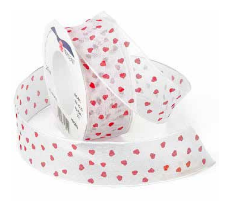
Hearts (wired sheer)

35025/20-001 1" x 22 yds 35040/20-001 1 1/2" x 22 yds