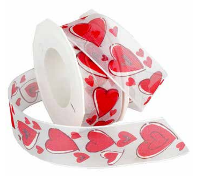
Sweetheart (wired sheer)

35025/20-001 1" x 22 yds 35040/20-001 1 1/2" x 22 yds